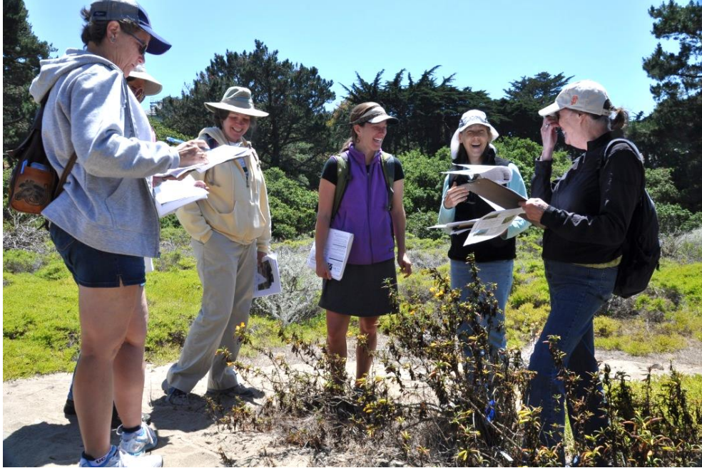
Figure 6. California Phenology Project observers monitor Mimulus aurantiacus at sites in Golden Gate National Recreation Area.

CPP training materials can be tailored to meet the needs of diverse audiences, including NPS resource management and interpretation staff, citizen scientist volunteers, formal and informal educators, partner organizations, and the general public. The CPP encourages experienced observers to modify and use these materials when training new observers. During the pilot period, the CPP provided >25 training workshops at pilot parks, which were attended by ~ 435 participants (Table 6). The CPP also offered training workshops and public presentations at a variety of non-NPS venues to a total of > 470 participants and attendees in an effort to recruit a broader network of volunteers and to support the long-term goal of expanding the CPP network (Table 7). The CPP also compiled information about the CPP, the USA-NPN, and other phenological monitoring and citizen science programs across the U.S. as part of an “online toolkit” (Appendix D).