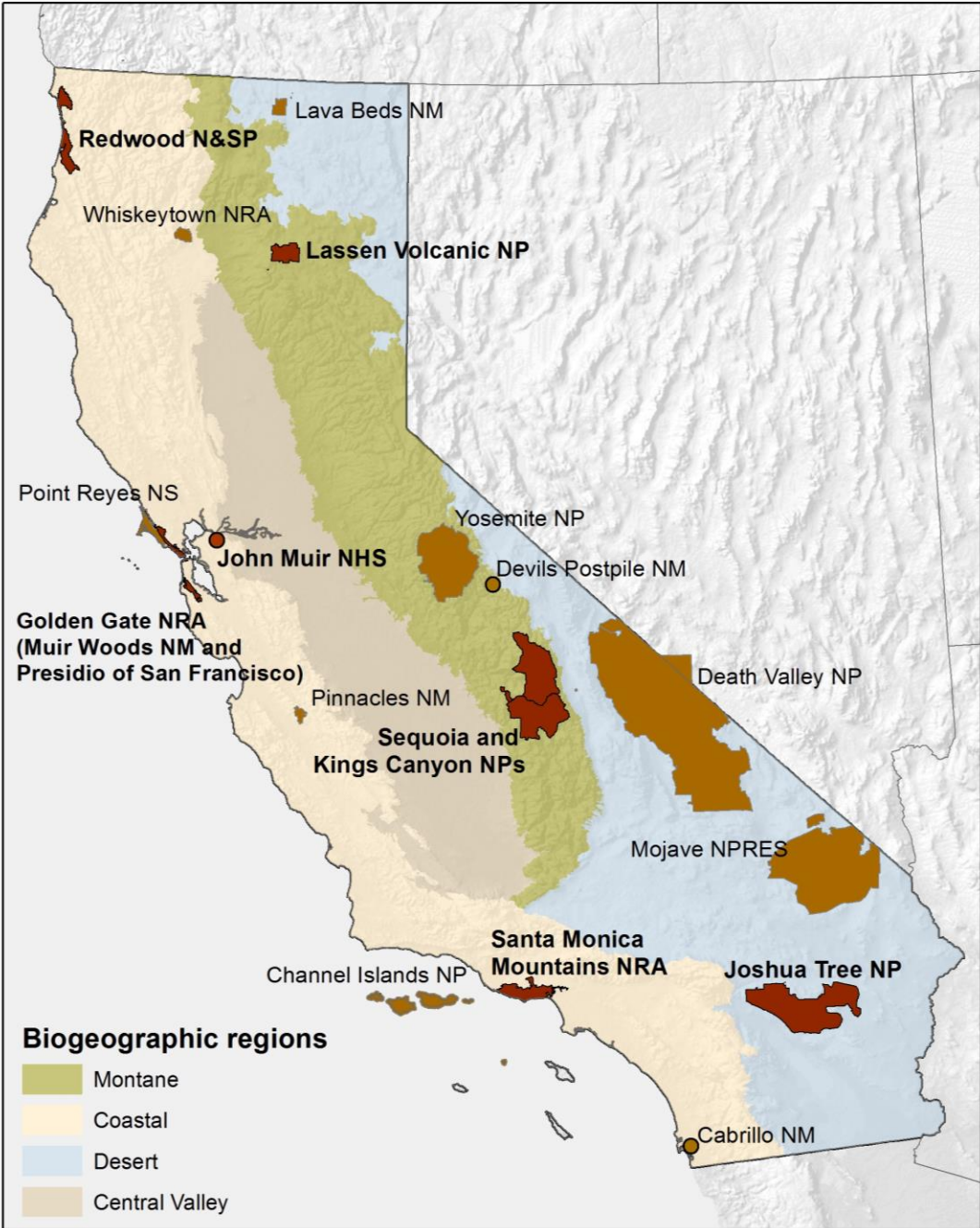
Figure 1. National Park Service units in California, with biogeographical areas overlaid. The seven California Phenology Project pilot parks are shown in dark red.