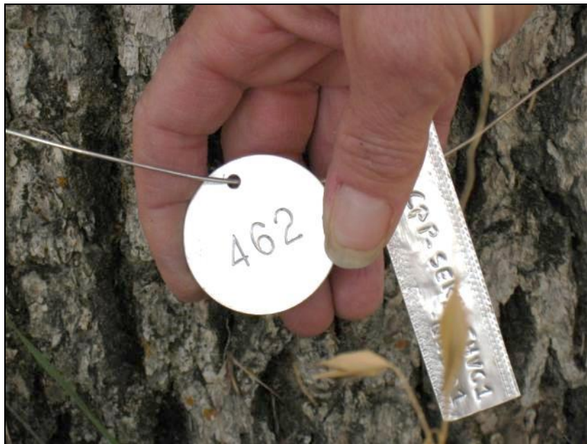
Figure 4. A California buckeye ( Aesculus californica ) tagged at a monitoring site near the Foothills Visitor Center in Sequoia and Kings Canyon National Parks.